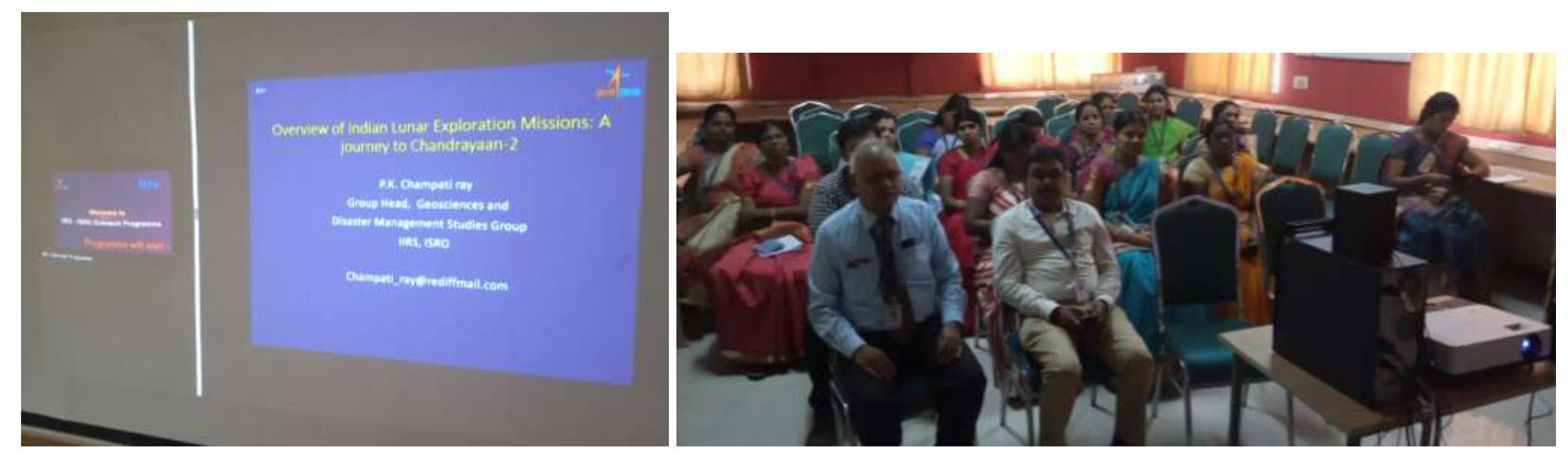
57th Geo-processing and Visualization on Web Platform on January 27-February 07, 2020 Participation : 27 Students

1009th Remote Sensing of the Moon by Indian Lunar Missions with Emphasis on Spectroscopic Analysis-One day workshop on December 23, 2019 Participation : 11 Faculty members